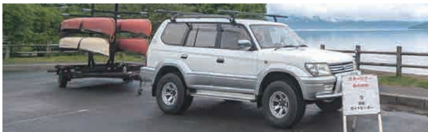
Find staff around this vehicle with lifejacket